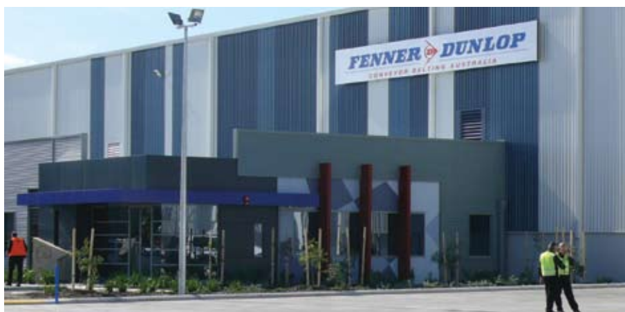
Fenner Dunlop's new premises have been designed to meet the growing demands of the mining industry.

belt, you need the best hi tech equipment," he explained.