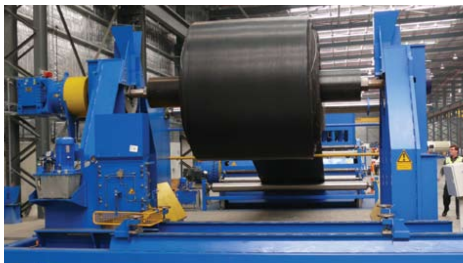
The company remains a strong global force in the steel cord conveyor belt manufacturing sector.

"Lastly our philosophy is that we will never over promise or under deliver."